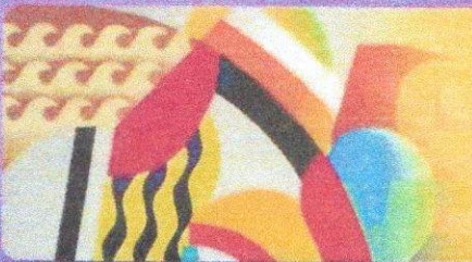
CIO REYES | Aton Wave Series 16, 2020

DIVE INTO THE UPDATED FRAMEWORK TO ENHANCE GENDER MAINSTREAMING AND GENDER-RESPONSIVE PLANNING, IMPLEMENTATION, AND EVALUATION